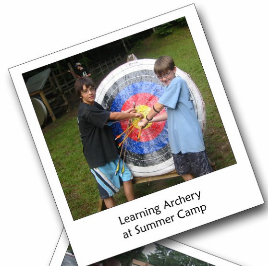
Learning Archery at Summer Camp

Annual troop dues are $75, which covers troop supplies, equipment, and operating costs. Trips often cost $10 - $15. No one will be turned away because of financial need. Come join us and see what having fun is all about!