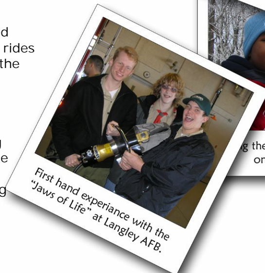
First hand experience with the "Jaws of Life" at Langley AFB.